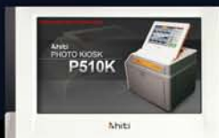
Intuitive User-Interface Design