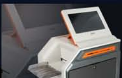
Compact and Stylish Design

The Smallest Integrated 6-inch Roll-Type Photo Kiosk