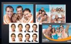
Multiple Imaging Service